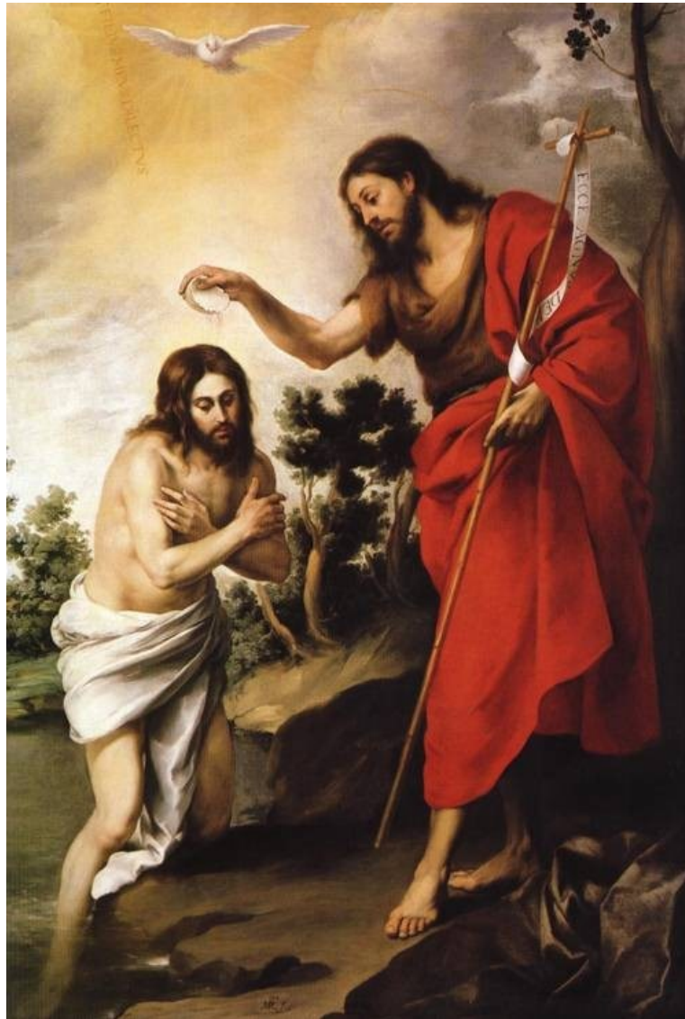
"Baptism of the Lord," Bartolome Murillo Oil on canvas, Spanish, 1655