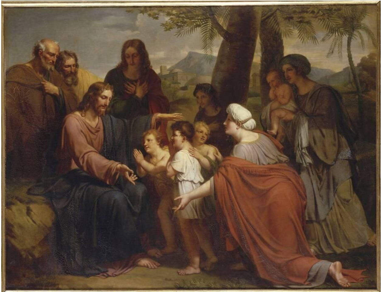
Christ Blessing Little Children (1839), Charles Lock Eastlake. Manchester Art Gallery

“Come to me, and I will give you rest. Take my yoke upon you, and learn from me, For my yoke is easy, and my burden is light.”