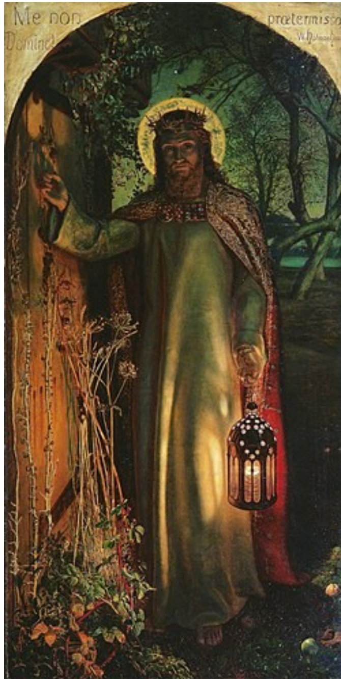
The Light of the World , William Holman Hunt Oil on canvas, English, 1854

1205 Dolley Madison Blvd. | McLean, VA 22101 703-356-3312 | umtrinity.org | info@umtrinity.org