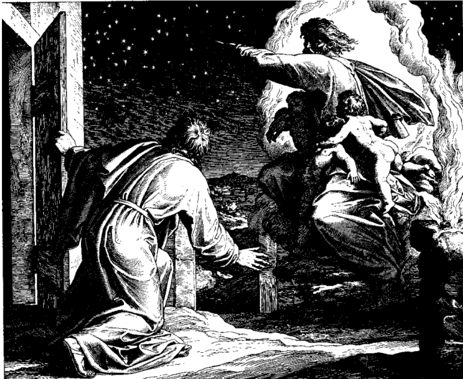
The Vision of the Lord Directing Abraham to Count the Stars, Julius Schnorr von Carolsfeld (German Wood engraving) 1860

When I consider your heavens, the work of your fingers,