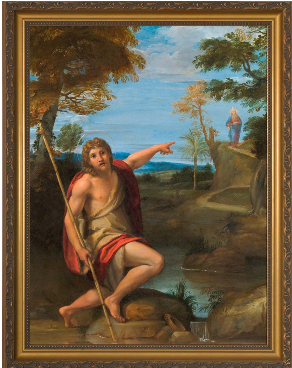
"Saint John the Baptist Bearing Witness," Annibale Carracci Oil on copper, Italian, c.1600