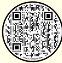
Scan QR code for Children & Youth Registration

For more youth activities, including service opportunities, please visit umtrinity.org/education/youth .