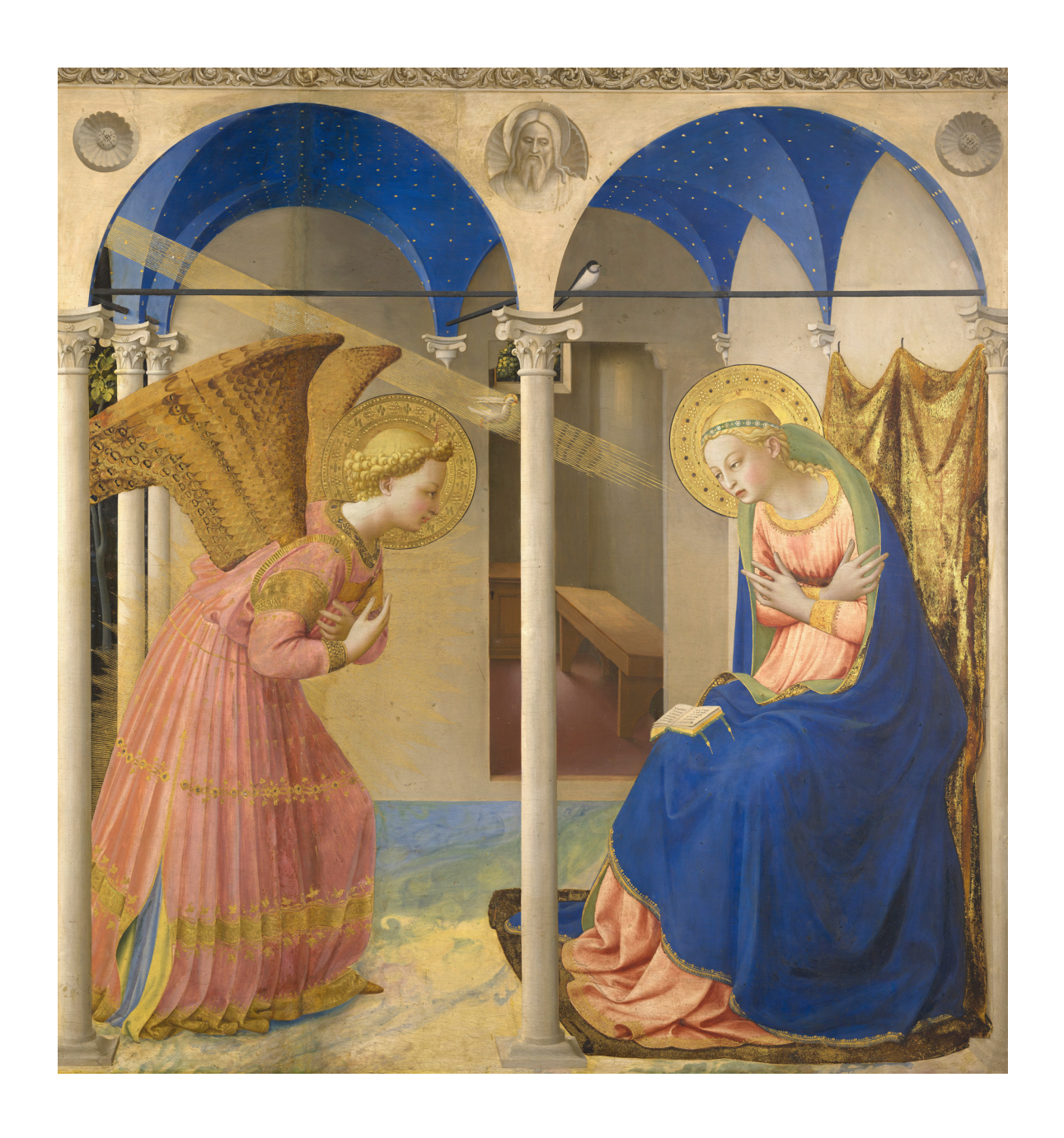
St. Paul's Episcopal Church December 11, 2022 • 5 p.m.