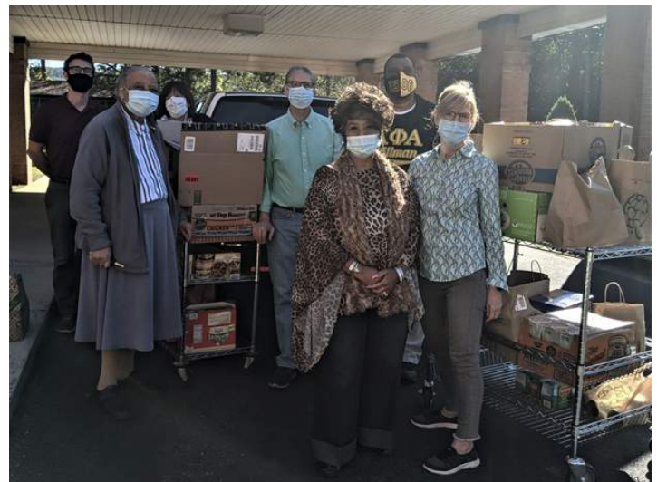
(Donations collected last year for Fellowship Presbyterian Church)