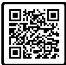
FOR ONLINE GIVING

In addition, we have added QR Codes to the bulletin. Most smartphones can scan QR Codes with the camera on the phone. Once scanned, the code can take you directly to the webpage the code denotes. We hope these codes will help you better access our online resources.