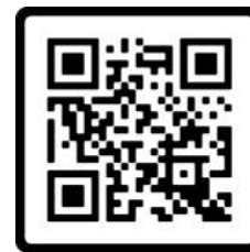
SCAN FOR WEBSITE