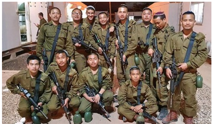
B'nei Hmenashe doing Aliyah to Israel

The story of Judaism isn't a story about just religion; it's a story of one big family! 12 brothers of Ya'akov that became the 12 tribes of Israel, some of them were lost during our long history and today we're privileged to unite with our lost brothers!