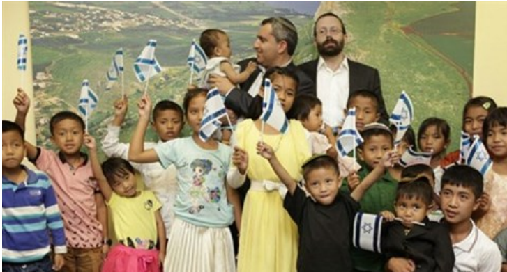
12 members of B'nei Hamenashe joining the IDF