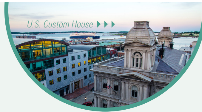
U.S. Custom House ▶▶▶

This three-story brick building features a number of long, narrow windows with pointed arches at the top. The windows – known as lancet windows – draw upon the Gothic Revival style of architecture. Before the building housed Bull Feeney’s – a popular Old Port pub and restaurant – it was home to the Portland Seamen’s Friend Society, an organization that provided food, entertainment, lodging, spiritual needs, and general advocacy for sailors.