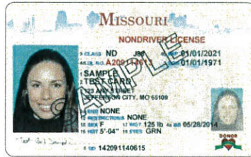
Missouri Non-Driver License