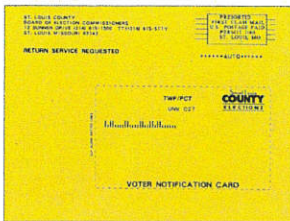
Voter Registration Card

Present ONE of the following forms of acceptable identification and sign the provided statement.