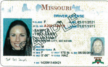
Missouri Driver License

Present ONE of the following forms of valid photo ID.