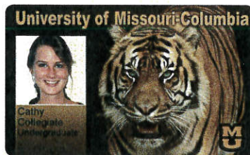
ID from a Missouri University, College, Vocational or Technical School