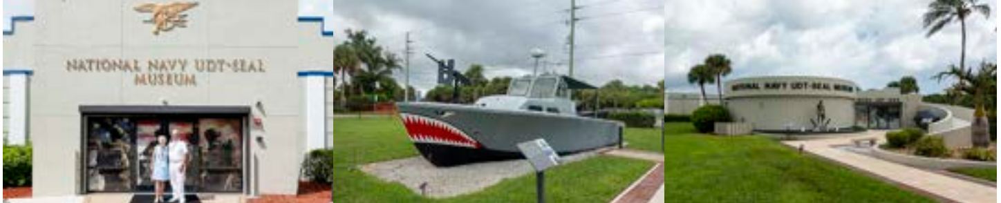
The attendees has a great opportunity to see the incredible and heroic efforts the SEALs have performed over the years.