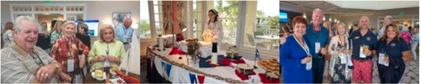
Friday evening at the Mooring Yacht and Country Club was not to be missed. Great food and camaraderie in a beautiful setting.