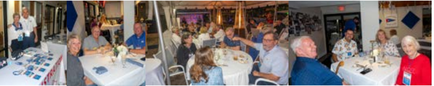
Delightful dinner on Friday night.