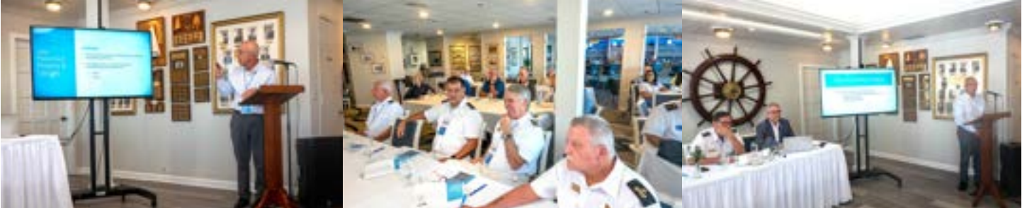
The 10:00 A.M. The in-depth special meeting on risk management and insurance was very informative.