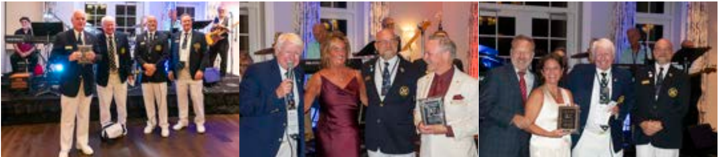
Award winners by land, by sea and by numbers which Vero Beach Yacht Club won.