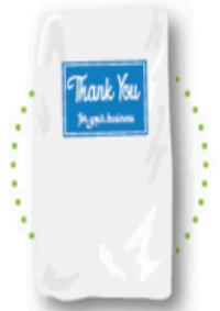
Dry cleaning bags