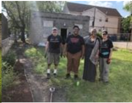
Trimmed hedge, and mowed lawn