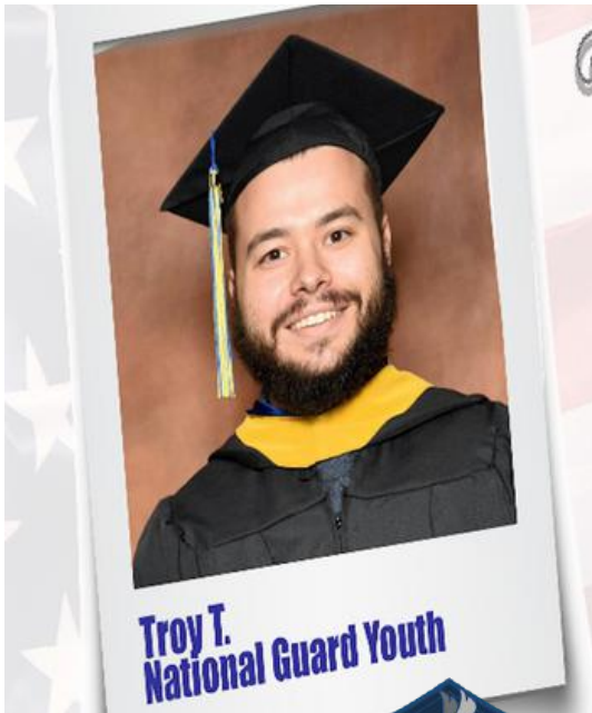
Troy T National Guard Youth