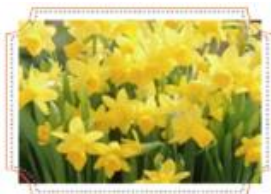
_____ Daffodil ($8.25)