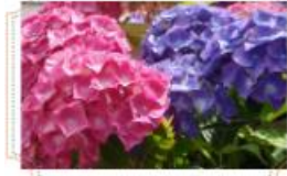
_____ Hydrangea ($14.00) (Pink/Blue)