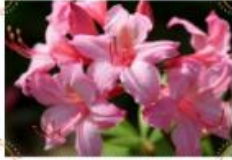
_____ Azalea ($12.50) (White/Pink)