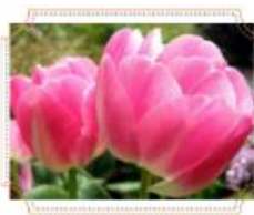
_____ Tulip ($8.25)

Dedication: (to be printed in the Easter worship bulletin)