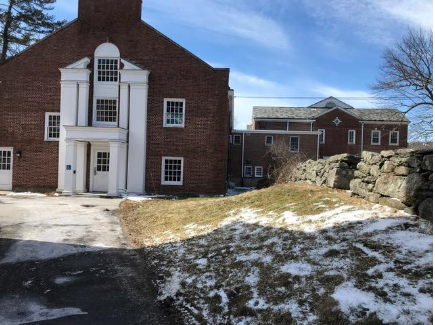
What started as a piece of barren land, seemingly without value