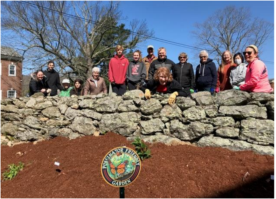
into a haven for bees, butterflies, insects, and birds