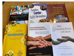
Intergenerational Ribbons & Intergenerational Resources