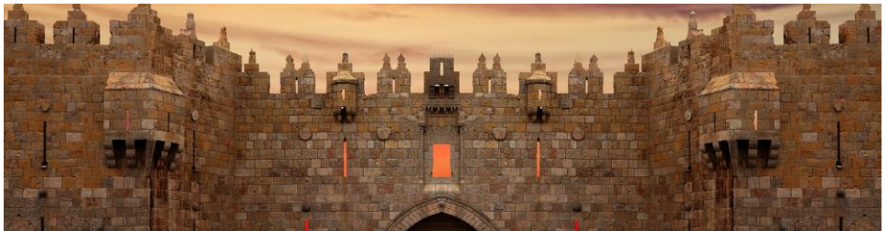
The gates of Jerusalem