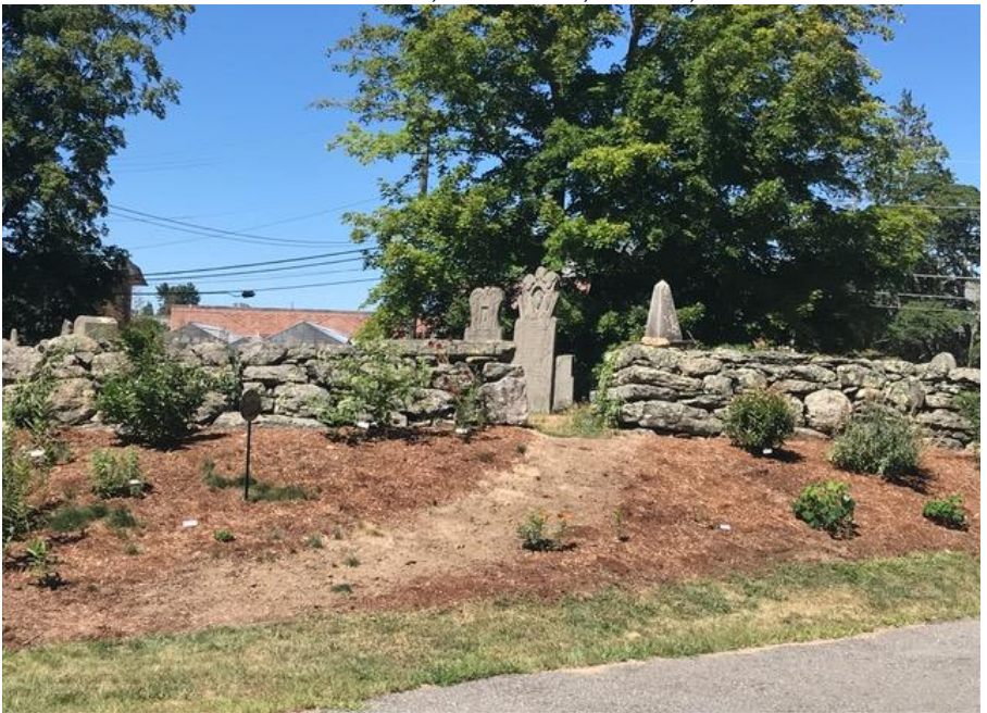
thriving as God had intended. Make a plan to visit the garden often this summer!