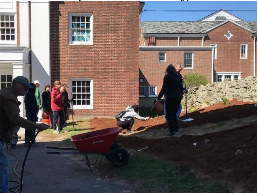
was transformed by many hands, shovels, plants and mulch