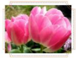
_____ Tulip ($9.50) (6" pot w/ 5 blooms)

Dedication: (to be printed in the Easter worship bulletin)