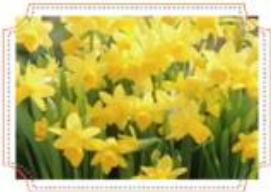
_____ Daffodil ($9.50) (6" pot w/ 5 blooms)

Due to their heavy scent, some Easter Plants are offensive inside the Meeting House. To be welcoming to all, we will be eliminating Lilies (Easter, Asiatic & Oriental) and Hyacinths from our selection this year. Because Easter is early, Azaleas are also not yet available.