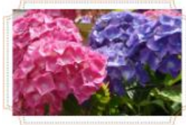
_____ Hydrangea ($17.00) (Pink/Blue)