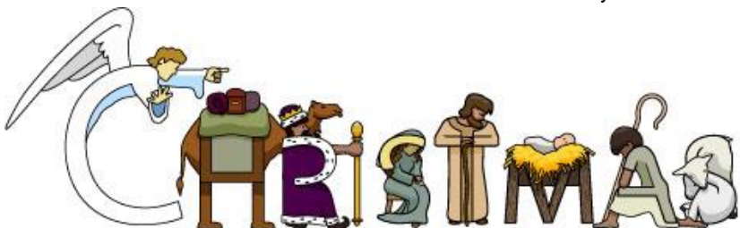
CHRISTMAS IS THE CELEBRATION OF THE BIRTH OF JESUS, THE SAVIOUR OF MANKIND