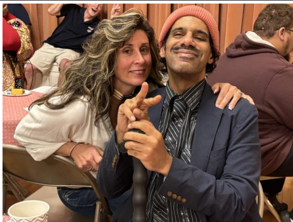
SCC Coffeeshouse – September 29 th 2024