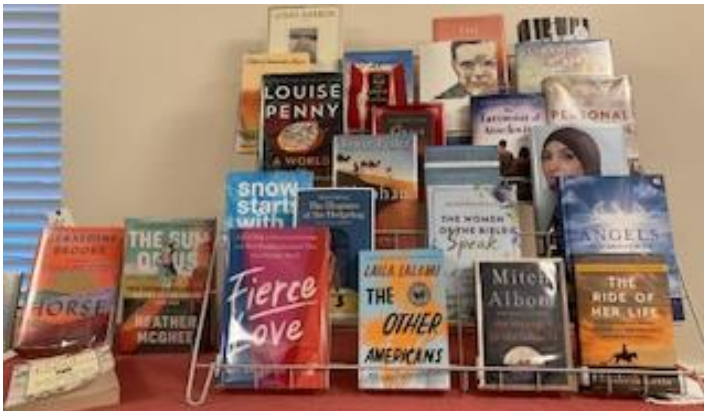
January Book Rack in the Library