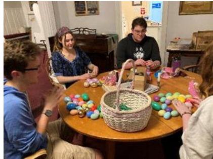
"Tuesday Talks" Easter Egg Hunt