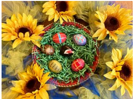
Our Ukrainian Easter Eggs