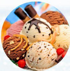
St. Gregory's Episcopal Church, Harris Hall