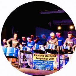
St. Gregory's Episcopal Church, Harris Hall

Stay connected this Summer with St. Gregory's exciting lineup of events. All events are offered at no cost. We can't wait to see you there!