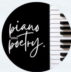
St. Gregory's Episcopal Church, in the Sanctuary

Join us for a sweet treat! St. Gregory's invites you to an Ice Cream Social in Harris Hall on Sunday, July 13 during coffee hour. Here's the scoop - this fun event will be the perfect opportunity to cool down, connect, and enjoy fellowship with your St. Gregory's friends while indulging in delicious ice cream and your favorite toppings. Don't miss the chance to beat the heat and celebrate the joys of summer together!