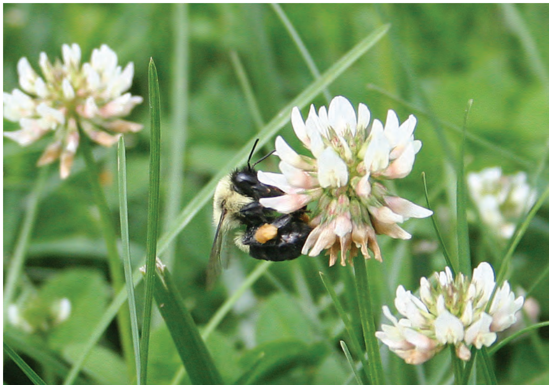
Figure 3. Flowering weeds should be mowed before pesticides are applied to avoid impacting pollinators.

It is important to minimize the impacts of pesticides on bees and beneficial arthropods. Pesticide applicators must use appropriate tools to help manage pests while safeguarding pollinators, the environment, and humans. As detailed in the NYS Pollinator Protection Plan, the state has committed to IPM on state lands “by managing pests on turf and ornamental plants solely through mechanical, sanitary, cultural or biological means to the maximum extent practicable” while recognizing that pesticide use is necessary under certain circumstances.