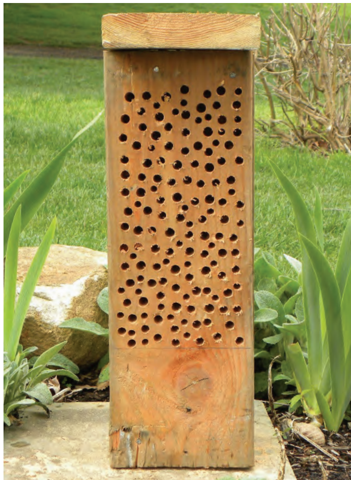
Figure 5. Wood boxes with varying size drill holes provide nesting for different bee species.