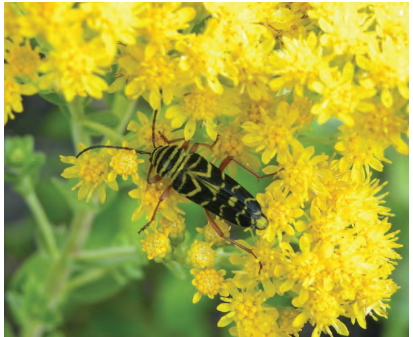
Figure 1. Both domestic honey bees (left) and any one of the 400+ species of wild pollinators in New York State (right) may forage on flowering plants on or near golf courses.