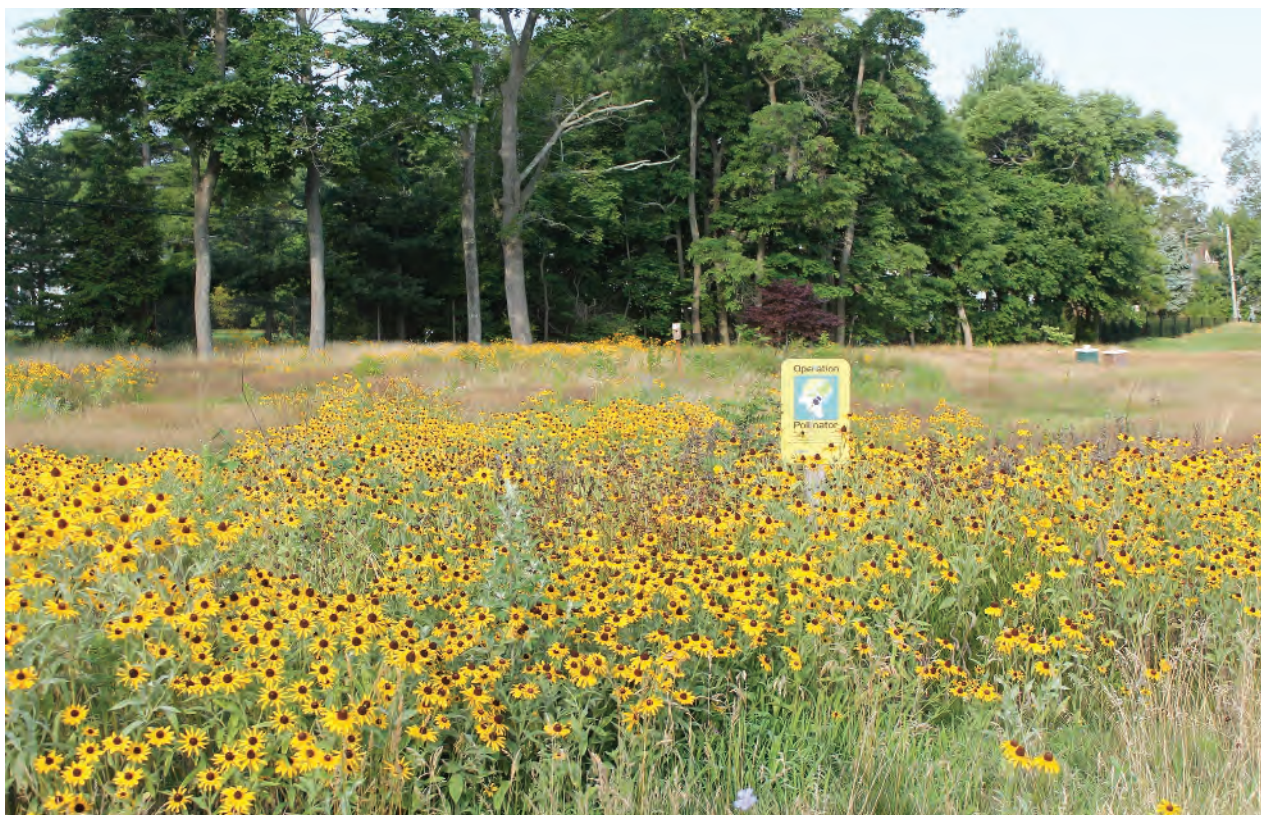
Figure 7. Established wildflower area in mid-summer.