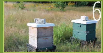
TABLE OF FIGURES