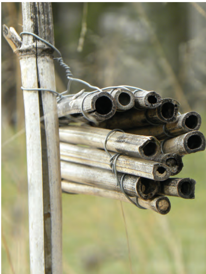
Figure 4. Bamboo sticks are an easy way to create nesting site for bees.