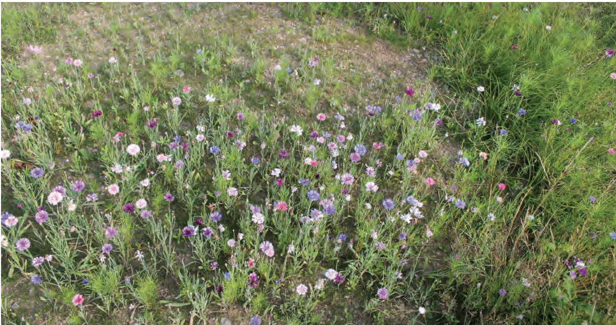
Figure 6. First summer of a newly established native wildflower area.