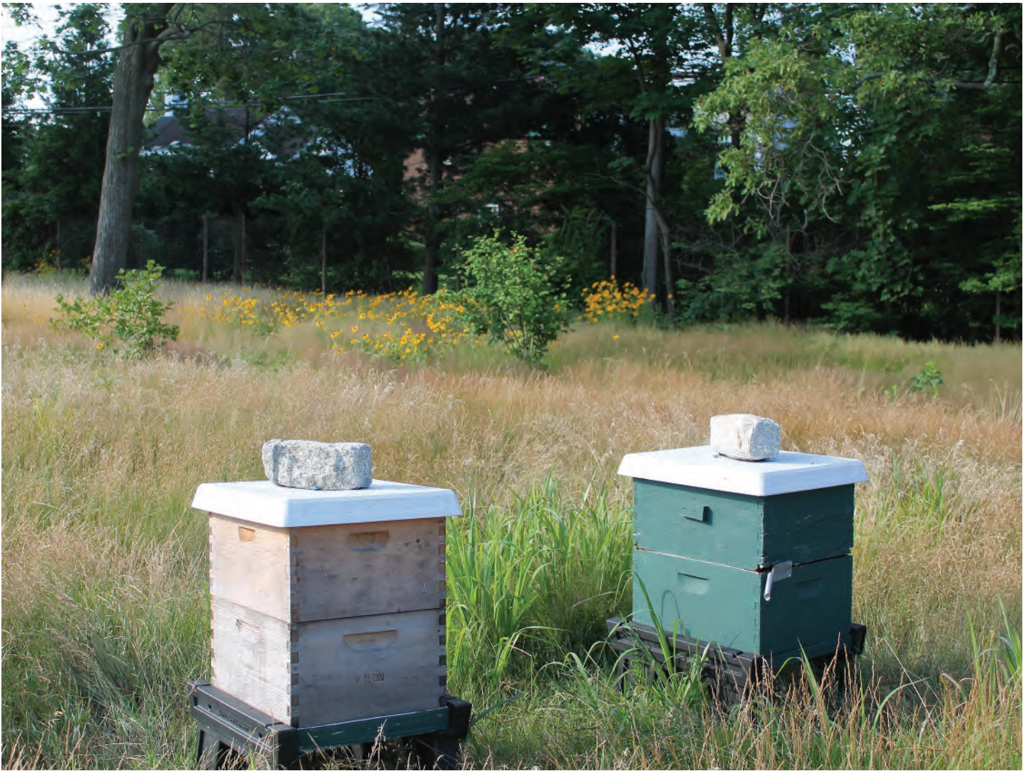
Figure 8. Managed hives at Rockville Links Golf Club on Long Island.