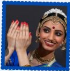
Early High School