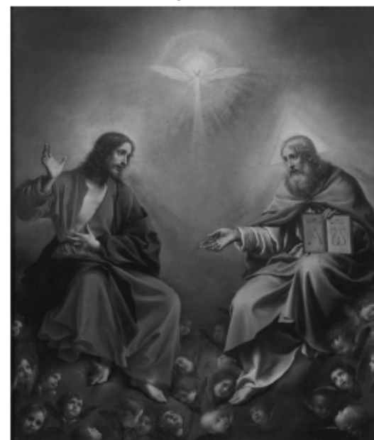
The Trinity in Glory (1640) by Carlo Dolci Rhode Island School of Design Museum