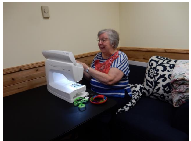
Saturday September 10th- Our Hands Deliver