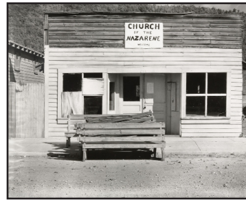
Church of the Nazarene, Tennessee, 1936, by Walker Evans

The painting, Sheaves of Corn , in the MMAA collection has become a heralded favorite attracting visitors from across the country. It was seen by 4.5 million Chinese and Russian museum goers in 2008 when MMAA loaned it to the Guggenheim Museum in New York City for a special first-hand look at American Art in China.