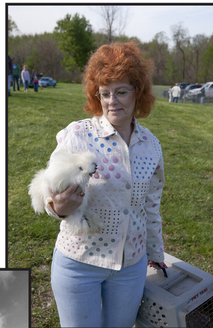
Woman with a Silkie Bantam, Wolf's Animal Swap Meet, Ligonier IN, 2008