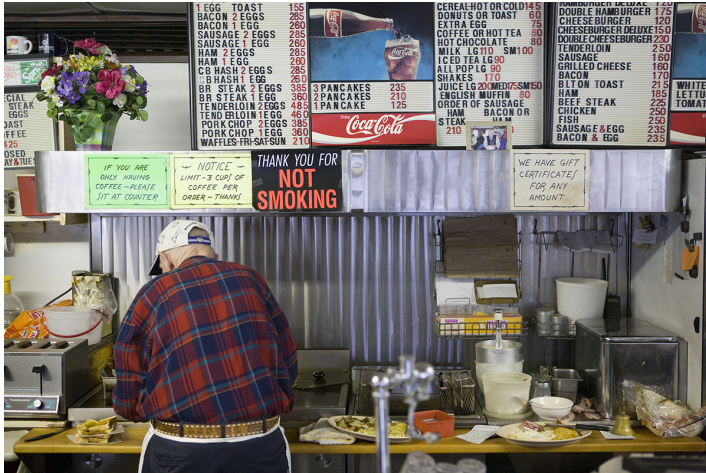
White House Hamburgers, Logansport IN, 2006 by Kay Westhues

Brief comments by Artists and museum staff.