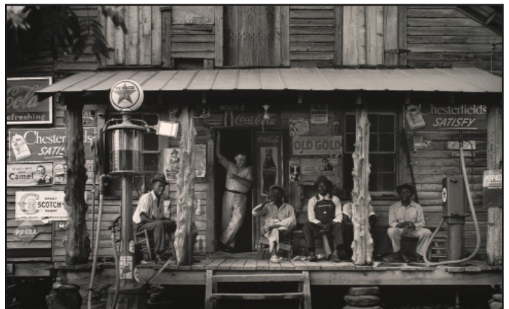
Crossroads Store, North Carolina, 1939 by Dorothea Lange