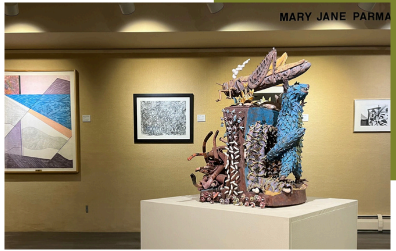
Made in Michiana a collection of every Best of Show Award from each Elkhart Juried Regional since 1979.