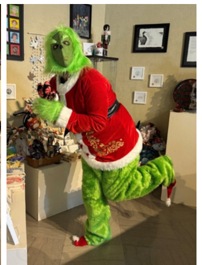
Winterfest at MMAA with a musical performance by Elsa & Friends, a surprise appearance by The Grinch, and craft activities for kids and families.