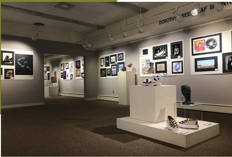
Youth Art Month 45th Annual Celebration featuring 154 students with 183 works of art from 4 area high schools: Elkhart, Concord, Northridge, and Elkhart Area Career Center.