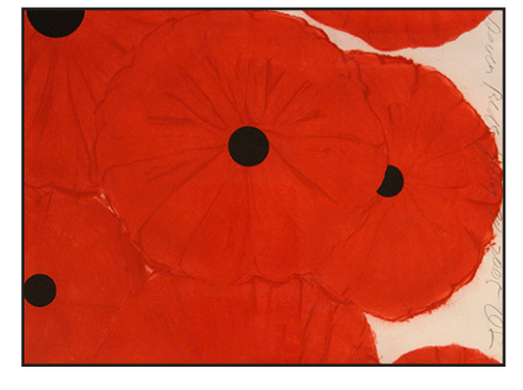
by Donald K. Sultan (b.1951-) "Seven Reds", 2005, pastel & flocking,