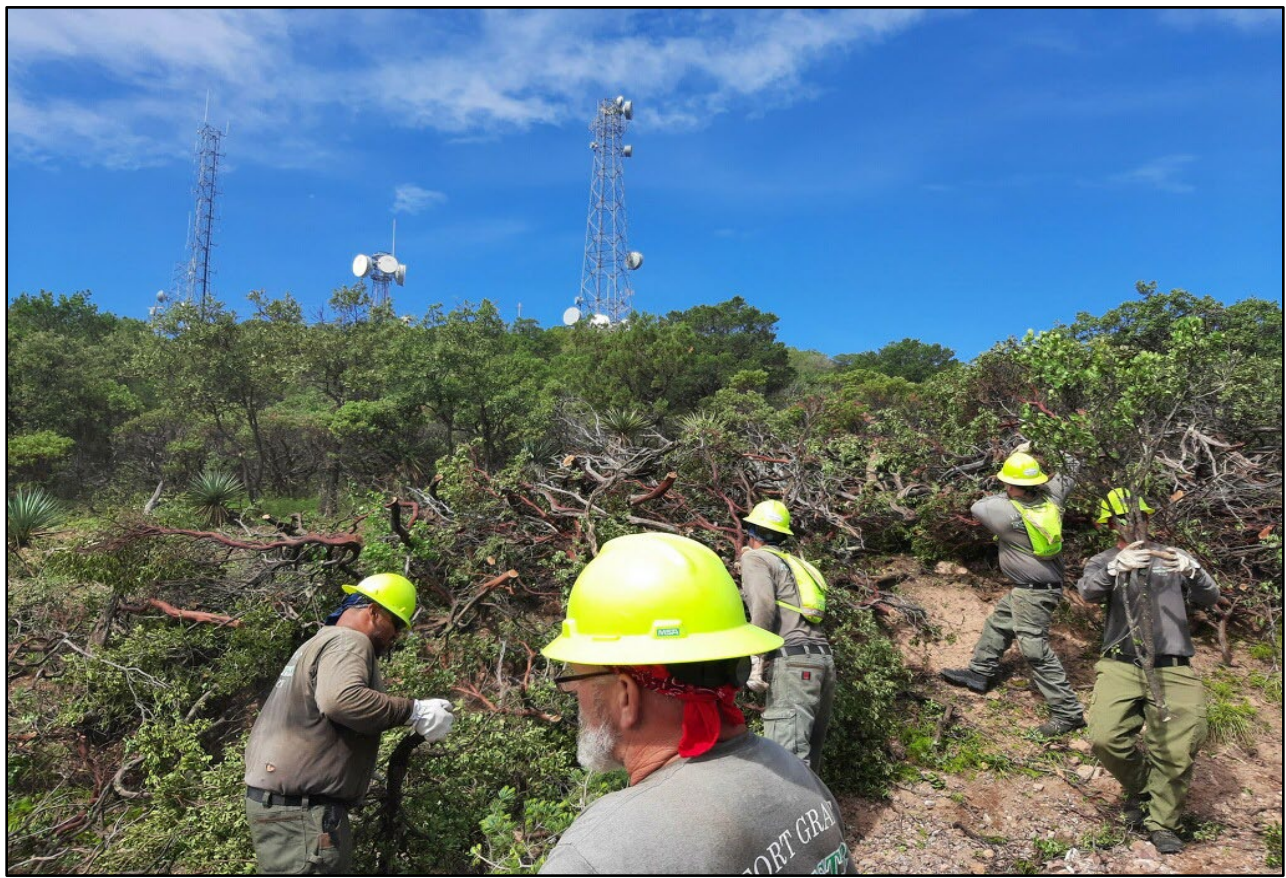
Figure 3: Ft. Grant crew working to thin out the Juniper Flats project, which will protect the communication towers from future fire risk, located just northwest of Bisbee.

https://www.azstatejobs.gov/jobs/search .