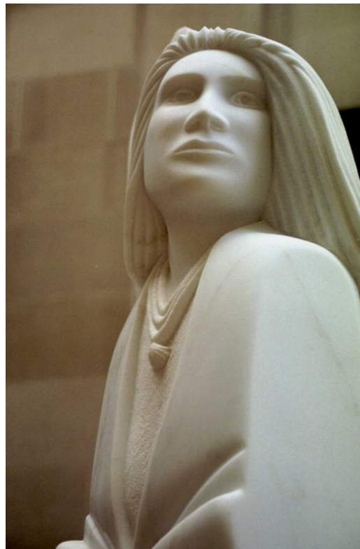
Heart Locket by Cliff Fragua (Jemez) is one of many sculptures that grace the patio sitting