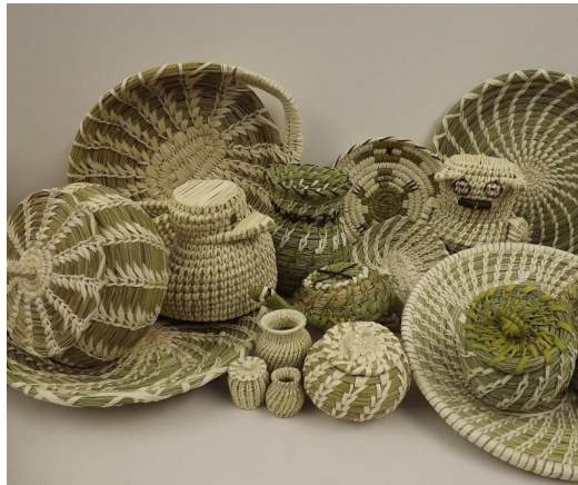
Tohono O'Odham basketry from southwestern Arizona

We have many new arrivals at the Shop and will continue to receive packages, since we've just returned from the spring IACA buying trip! Some of our most recent arrivals include a wonderful selection of Tohono O'Odham basketry in so many shapes and sizes -- there's sure to be one that just speaks to you.