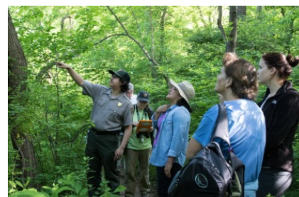
BioBlitz species inventory led by a National Park Service ranger.

BioBlitz is a popular and effective technique for parks, schools and other organizations to learn more about what lives nearby, teach scientific