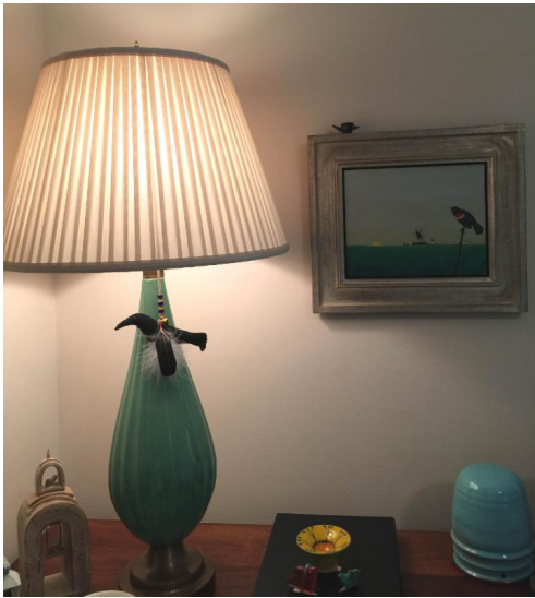
A lovely nightstand display of artwork.

Would you like to share photos of your home décor? We would love to see and share the variety of ways people display their collections and hope you will join in the "collection of display ideas."