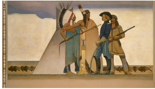
"Themes of the Bureau of Indian Affairs: Indian and Soldier," Maynard Dixon, 1939.

skills and generate useful scientific data while cultivating a community of experts, teachers, students, and neighbors.