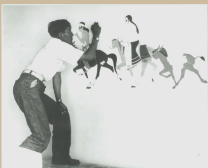
Allan Houser in 1938 painting the mural 'Breaking Camp' on the north wall of The Indian Craft Shop.