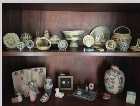
A beautiful arrangement of basketry, pottery and collectibles with miniatures and basketry organized together on top shelf.

Would you like to share photos of your home décor? We would love to see and share the variety of ways people display their collections and hope you will join in the "collection of display ideas."