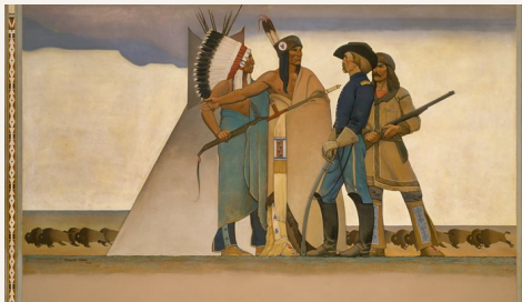
"Themes of the Bureau of Indian Affairs: Indian and Soldier," Maynard Dixon, 1939. Fine Arts Program U.S. General Services Administration

For the latest programs and events hosted by the Interior Museum or to make reservations for Mural Arts Tours, contact the Interior Museum at (202) 208-4743 or check out their online information .