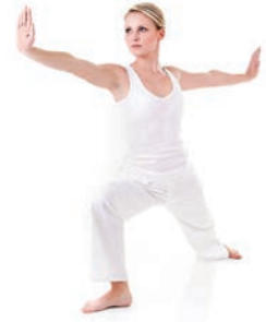
"Tai Chi" by Spaso Zen (CC by 4.0)

Tai Chi is an ancient exercise that involves slow-paced turning and stretching. It has been shown to help improve circulation, balance, and posture; increase strength and flexibility; and reduce stress. The activity is good for all ages. Comfortable, loose clothing is advised. Tennis shoes or socks work best. This is an intermediate level class.