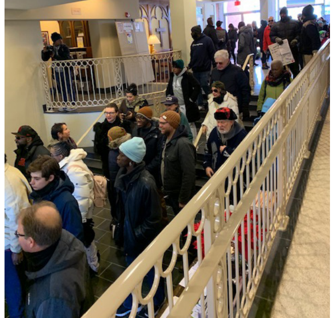
Annual MLK Jr. march of 300 to 350 people that ends in our sanctuary

We propose to build better entryways for all users, from Sunday morning visitors to weekday Walk-In Ministry clients. We propose to build a safe way for everyone to access the staff offices. In short, we want our building to say that we honor and welcome everyone who comes to our doors.