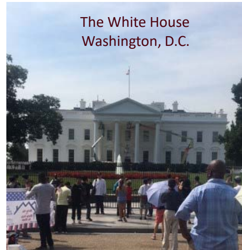
The White House Washington, D.C.