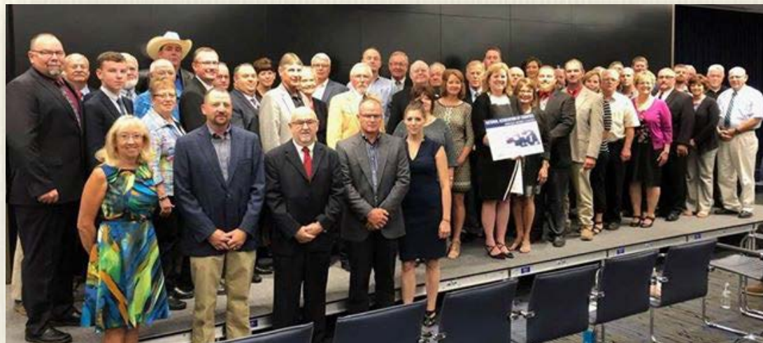
County Officials from Kansas and Nebraska