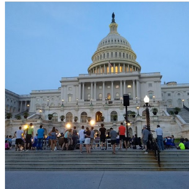
Left: Marine Corp Band plays on the steps of the White House