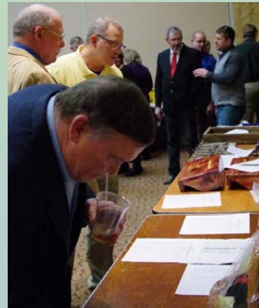
Above Left: NWCA Scholarship Auction (Over $2000 raised this year)