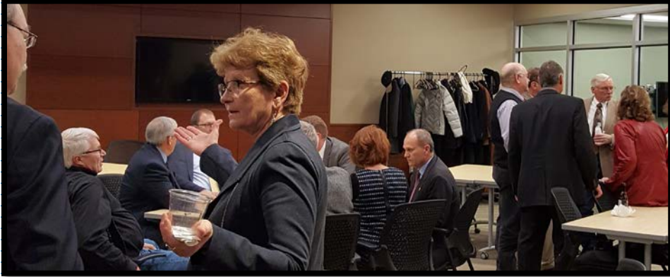
Above and below: members of the NACO Board meet with State Senators during a reception at the NACO Offices in Lincoln.