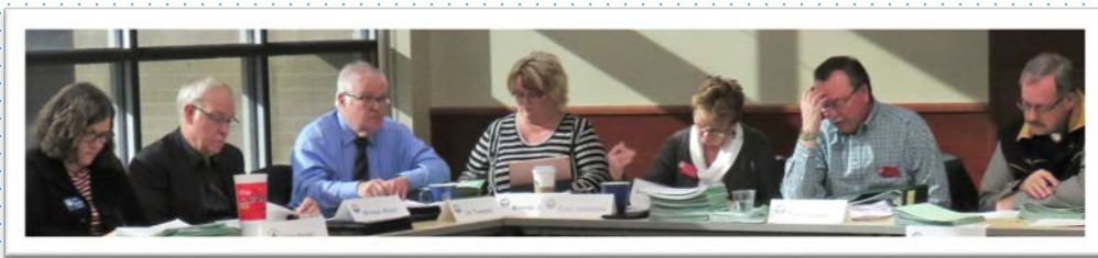
NACO board members review bills up for discussion