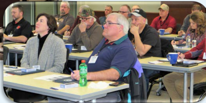
Above: New county officials are introduced to NACO.