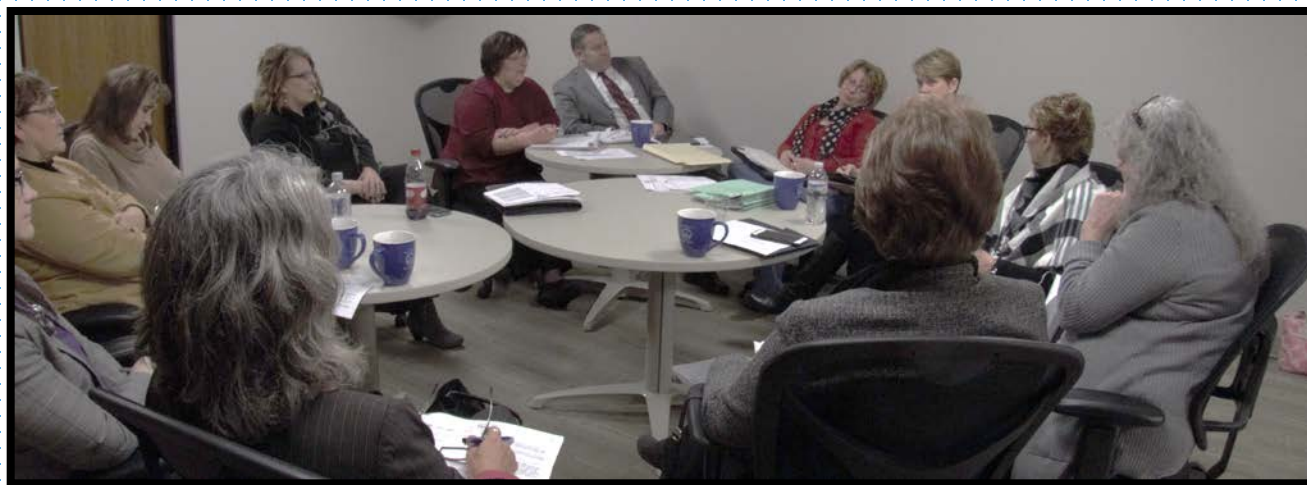
The Clerks of the District Court breakout discussion on LB344

Clerks, Register of Deeds, and Election Commissioners discussion on LB152, as well as other bills related to their fields.