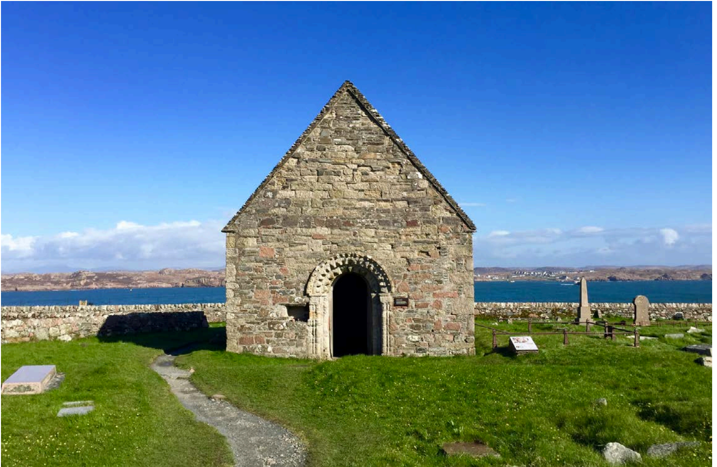
Caibeal Odhrain (St. Oran's Chapel), which stands in the middle of the main cemetery on the Isle of Iona, was built in the 12th century. Oran, traditionally a cousin of St. Columba, is said to have martyred himself, offering to be buried alive to sanctify the cemetery.