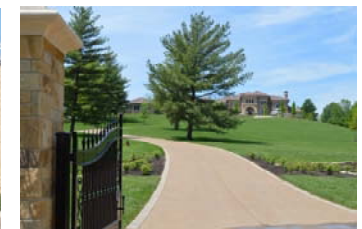
Decorative Residential Myer Residence Leawood, KS

Top Golf Summit Concrete Quicksilver Readymix LLC ARCO National Constr. Co. Renaissance Infrastructure Cons. Kaw Valley Engineering