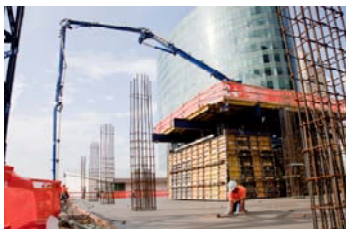
High Rise One Light Tower Kansas City, MO

Aspen Salon D&B Concrete Services LLC Geiger Ready-Mix Co., Inc.