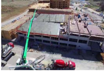
Multi Family The Domain at City Center Lenexa, KS