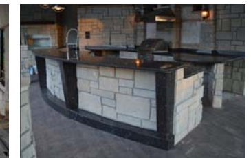
Countertop/Furniture Pool House Outdoor Area Lee's Summit, MO

City of Kansas City, MO George J. Shaw Construction Talon Concrete & Aggregates Whiting-Turner Contracting Co. RNL HDR Kansas City Testing & Engineering