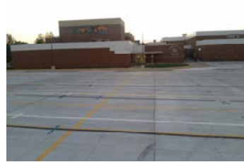
Parking Lot Blue Valley High School Stillwell, KS

The Cordish Company J.E. Dunn Construction Co. Talon Concrete & Aggregates Humphreys & Partners Architects Optimal Engineering Solutions, Inc. TSI Engineering, Inc. Harris Rebar