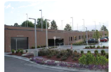
Parking Garage HCA Overland Park Regional Hospital Overland Park, KS

Smith Family Overland Concrete Construction Geiger Ready-Mix Co., Inc. Pfefferkorn & Baldrige Eng.