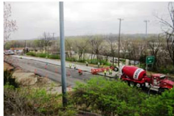
Municipal Paving Merriam Lane Kansas City, KS

Blue Hat Hoisting J.E. Dunn Construction Co. Talon Concrete & Aggregates Crawford Architects Wallace Engineering PSI