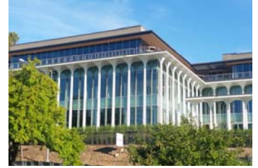
Concrete Renovation The 1900 Building Mission Woods, KS

Avenues at Overland Park ACS Concrete Construction Quicksilver Readymix LLC Morrow Construction