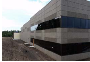
Site Cast Tilt-Up Sparhawk Laboratories Lenexa, KS