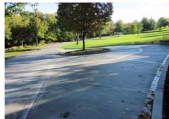
Residential Concrete Smith Residence Kansas City, MO

City of Kansas City, MO Kissick Construction Co., Inc. Talon Concrete & Aggregates HDR Engineering Kansas City Testing & Engineering