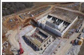
Infrastructure Hedge Lane Pump Station & Reservoir, Olathe, KS

HCA Healthcare J.E. Dunn Construction Co. Fordyce Concrete Co., Inc. Perkins + Will L A Fuess Partners PSI