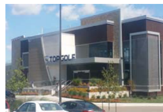
Recreational Facility Top Golf Overland Park, KS

Water District #1 of Johnson Co. Crossland Heavy Contractors Geiger Ready-Mix Co., Inc. Black & Veatch KTI