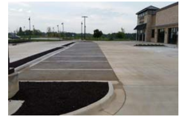
Pervious Concrete Aspen Salon Kansas City, MO

Missouri Dept. of Transportation Clarkson Construction Co. Fordyce Concrete Co., Inc. HNTB Corp. Realm Construction Inc.