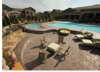
Decorative Commercial Avenues at Overland Park Overland Park, KS

Sparhawk Laboratories, Inc. Summit Concrete Strickland Construction Geiger Ready-Mix Co., Inc. Needham & Associates Hernly & Associates PSI