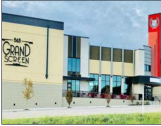
Site Cast Tilt-Up B&B Theatres Longview 7 Lee's Summit, MO

B&B Theatres Prosser | Wilbert Construction, Inc. Summit Concrete Talon Concrete Hollis + Miller Group, Inc. Olsson Associates