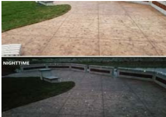
Decorative Residential Baier House Kansas City, MO

Worlds of Fun LMCC, Inc. J.J. Martiny Concrete Construction Century Concrete