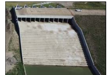
Spillway/Dam Lake Winnebago Expansion Lake Winnebago, MO

Sutton Trucking Elite Construction Enterprises Kody Construction Secon Construction Geiger Ready-Mix Co., Inc.