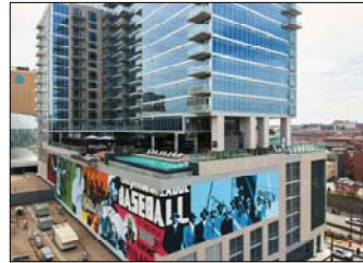
High Rise Two Light Tower Kansas City, MO

Baier Family Fleshman Construction, Inc. Geiger Ready-Mix Co., Inc.