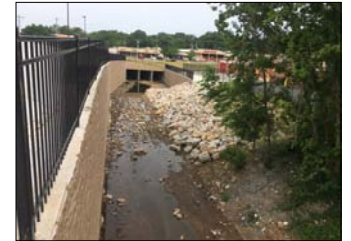
Infrastructure Nieman Storm Drain Improvement Shawnee, KS

Bear Bishop LLC ARCO National Construction - KC Fenix Construction Penny's Concrete, Inc. Clockwork Architecture + Design Stand Structural Engineering Inc. PSI