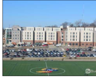
Multi Family KU P3 South Lawrence, KS

Custom Truck One Source Bottorff Construction Inc. Geiger Ready-Mix Co., Inc.