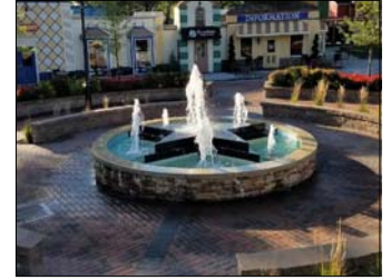
Monuments Worlds of Fun Star Fountain Kansas City, MO

University of Kansas CBG Kansas Builders, LLC Lithko Contracting, LLC Penny's Concrete, Inc. Trenor Architects Bob D. Campbell & Co. GeoSource