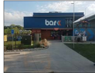
Recreation Bar K Dog Park & Restaurant Kansas City, MO

Cordish Company J.E. Dunn Construction Co. Ceco Concrete Construction, LLC Talon Concrete Hord Coplan Macht McLaren Engineering Group Gerdau TSi Geotechnical, Inc.