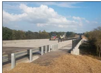
Bridge South Liberty Parkway Ph. II Liberty, MO

OPX, LLC Titan Artistic Concrete Surfaces, LLC