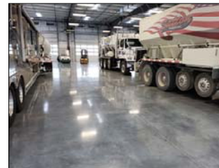
Polished Concrete Sutton Trucking Lee's Summit, MO

City of Liberty, MO Emery Sapp & Sons, Inc. Penny's Concrete, Inc. TranSystems Terracon