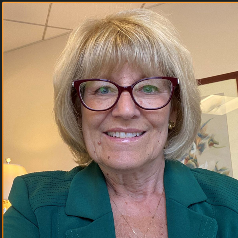
AUGUST 4 PANEL OF WITNESSES FACILITATED BY CLAIRE GREGOIRE