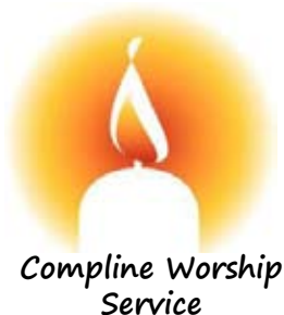
Compline Worship Service

Readings: Psalm 51:1-17; Matthew 6:1-6, 16-21