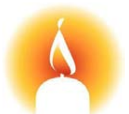
Compline Worship Service