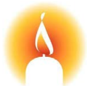
Compline Worship Service

Holden Evening Prayer Service The Fourth Wednesday of the month June 23 and July 28 at 7:00 p.m.