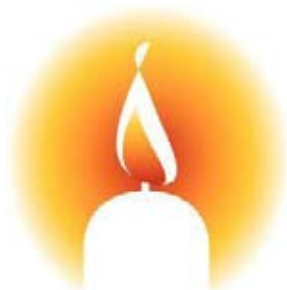
Compline Worship Service

Holden Evening Prayer Service The Fourth Wednesday of the month June 23 and July 28 at 7:00 p.m.