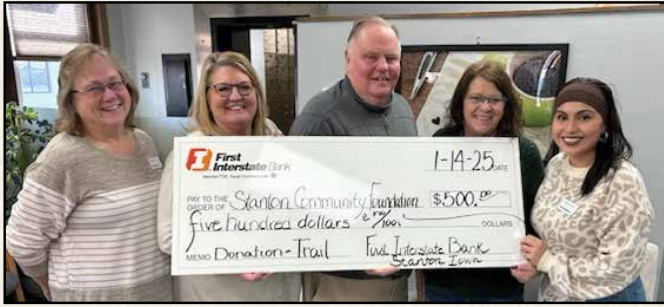
First Interstate Bank Donates to the Stanton Community Foundation