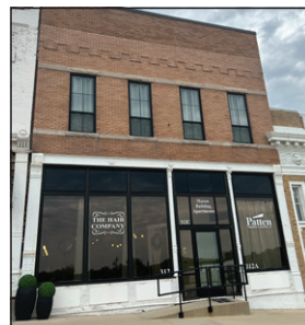
312 Broad Ave