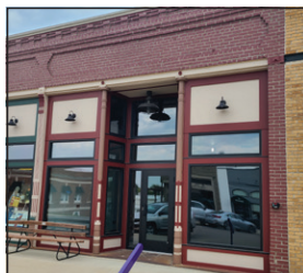
326 Broad Ave