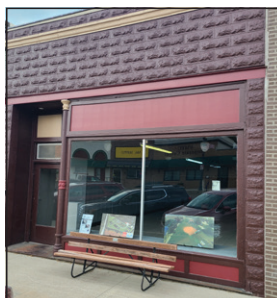
405 Broad Ave