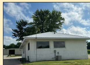
408 James Street