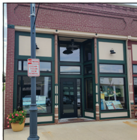
324 Broad Ave