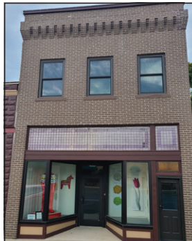
407 Broad Ave