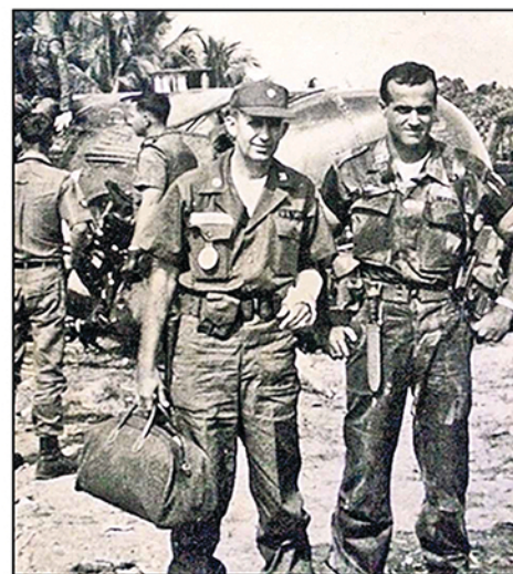
Then Captain Loeffke (right without a cap) walked away from a helicopter crash, where two soldiers died from head wounds during the 1960s. The crippled helicopter is in the background.

Burn Loeffke is a retired military officer, has been wounded, survived two parachute malfunctions and two helicopter crashes in combat.